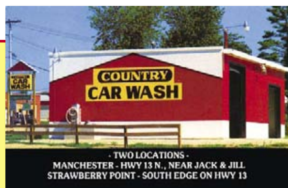
TWO LOCATIONS - MANCHESTER - HWY 13 N., NEAR JACK & JILL STRAWBERRY POINT - SOUTH EDGE ON HWY 13

"Going Postal" ... but in a good way. Jim Hill pioneered the interplay of "snail" mailing lists, post cards, tokens, and robust, creative co-op cross marketing strategies for his "Country Car Washes", in Manchester, Iowa. His primary goal of expanding his market radius well beyond the "normal" 3 miles was very successful.