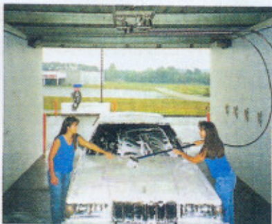
Foam Brush Bypassing